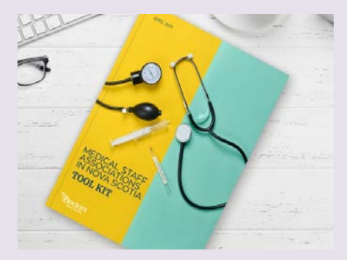
Medical Staff Associations in Nova Scotia Resources for physicians tinyurl.com/DNS-MSAtoolkit

Everything you need to know to provide synchronous care tinyurl.com/DNS-virtualcaretoolkit-3