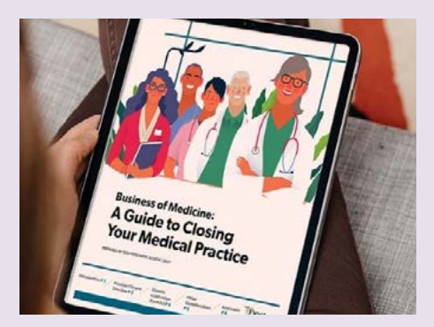
A Guide to Closing Your Medical Practice What to consider when retiring or relocating tinyurl.com/DNSCloseAPractice