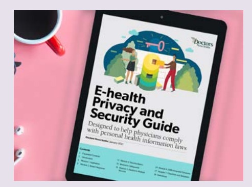
E-health Privacy and Security Guide Helping physicians comply with personal health information laws tinyurl.com/DNS-privacy-security