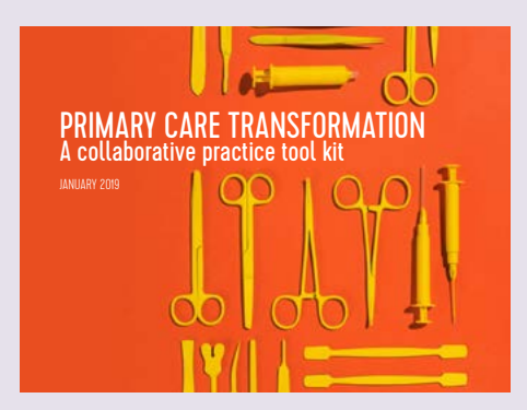
Primary Care Transformation: A collaborative practice toolkit tinyurl.com/DNScollabtoolkit

Doctors Nova Scotia develops toolkits to support physicians in their medical practice. The toolkits serve as reference guides, helping members navigate specific issues, challenges or transitions. Each toolkit provides practical information, examples and insights from the experiences of Nova Scotia's doctors. Physicians may choose to read the toolkit from cover to cover, or pick and choose, reading only the sections that answer their specific questions.